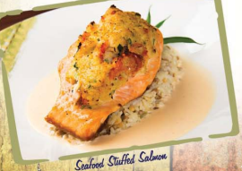
Seafood Stuffed Salmon