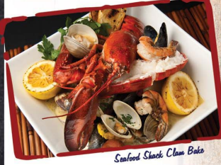
Seafood Shack Clam Bake

Fried Shrimp Platter .....27.95 Served with cole slaw, fries and a tangy cocktail sauce