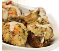
Seafood Stuffed Mushrooms

Seafood Stuffed Mushrooms .....18.95 Dressed with rich mornay sauce